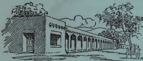
PALACE OF THE GOVERNORS

PUBLISHED QUARTERLY BY THE HISTORICAL SOCIETY OF NEW MEXICO AND THE UNIVERSITY OF NEW MEXICO